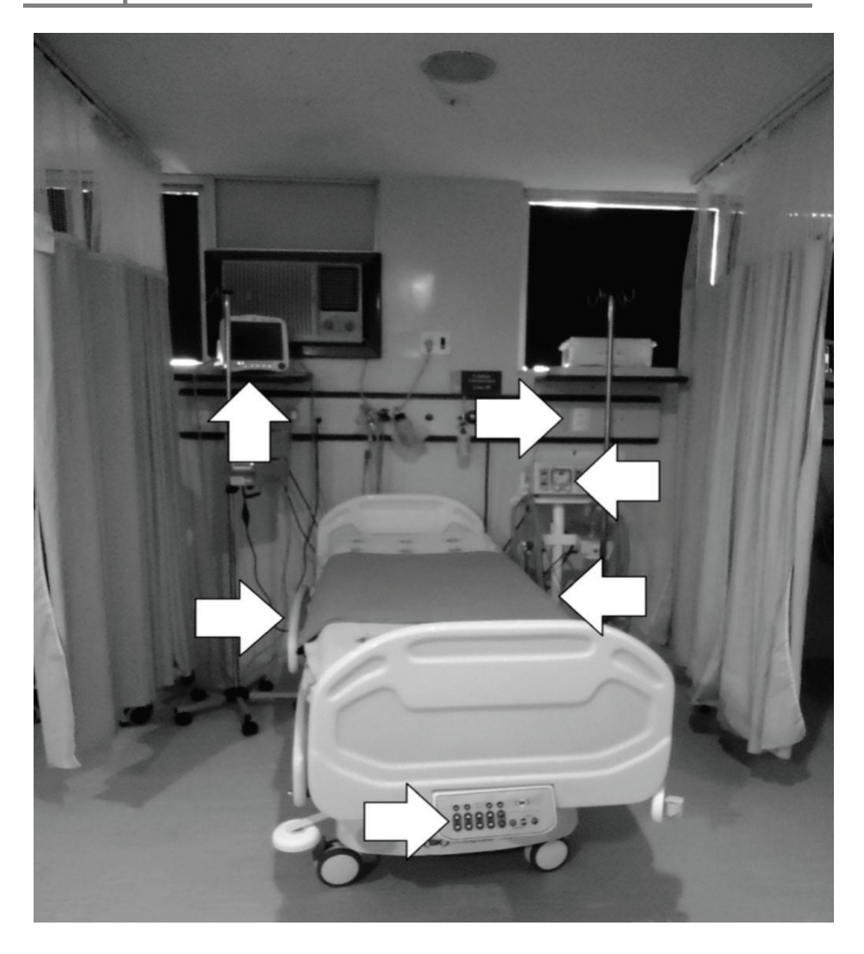
Figure 1. Equipment collected (arrows) in each bed

The collected data were typed, validated and processed in the software Excel 2010 (Microsoft Office). Descriptive analysis was applied to obtain the percentage of samples.